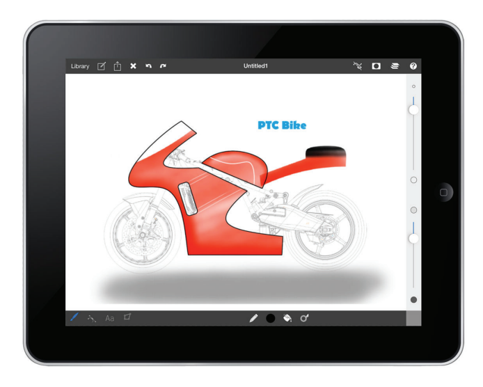
Generate file directly on the iPad